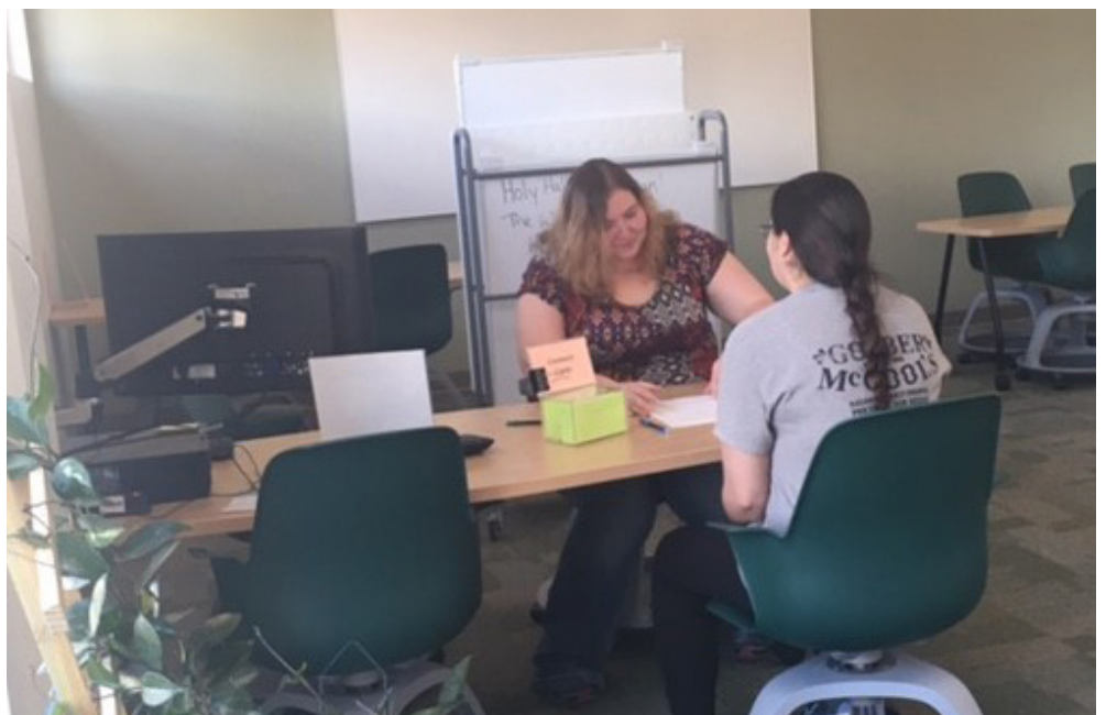
Below: ENMU Writing Center Tutors discuss tutoring issues